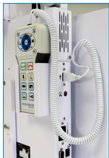
Tethered remote storage